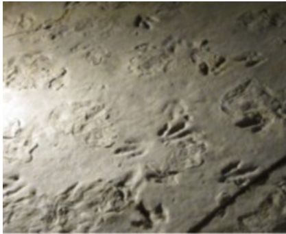
Dinosaur tracks on display at Dinosaur State Park.

In 1966, a construction worker was astonished when his bulldozer revealed large, three-toed footprints during excavation for a new state building in Rocky Hill, Connecticut. Hidden under the gray sandstone, scientists found 2,000 dinosaur tracks dating to the early Jurassic, 200 million years ago. After a decade of study, most of the tracks were buried again for preservation; but 500 dinosaur footprints were covered with a geodesic dome for public viewing. Dinosaur State Park was established so the public could marvel at what is one of the world's largest on-site displays of dinosaur tracks.