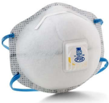
One of the 3M P95 particulate respirators.

Safety & Field Trips – David Rich mentioned the article in the newsletter about the man who passed away as a result of lung disease attributed to his lapidary hobby. The man had stressed using a dust mask every time rocks are ground or worked with. David said the 3M P95 dust mask is the one recommended. It is available at Harbor Freight among other sources. He stressed to be sure to wear a mask, dust can be in the water spraying up from the grinding process. Silica dust can cause silicosis, a disease caused by inhalation of crystalline silica dust (according to Wikipedia). David stressed that members need to wear gloves, glasses and MASKS.